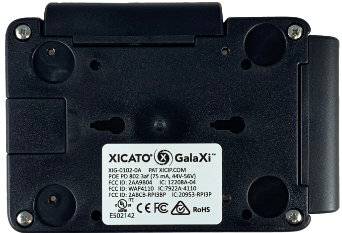
Figure 5: XIG-0102-BK bottom, showing mounting holes