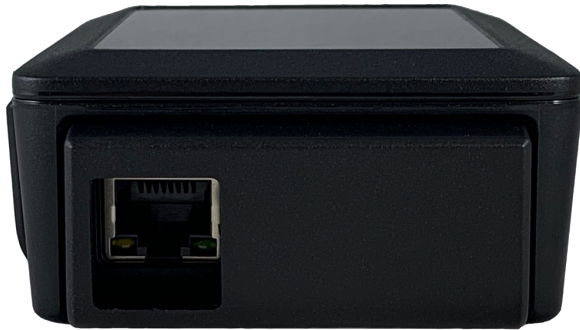
Figure 4: XIG-0102-BK showing RJ45 Ethernet/PoE port