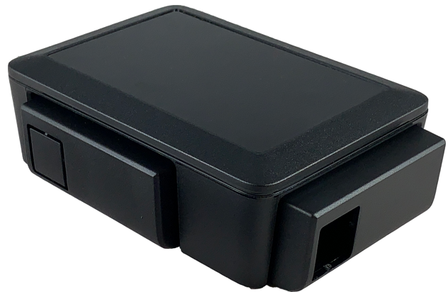
Figure 2: XIG-0102-BK