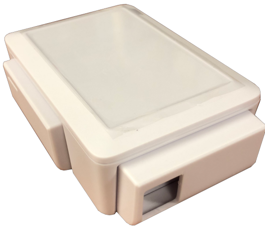
Figure 1: XIG-0102-WHT